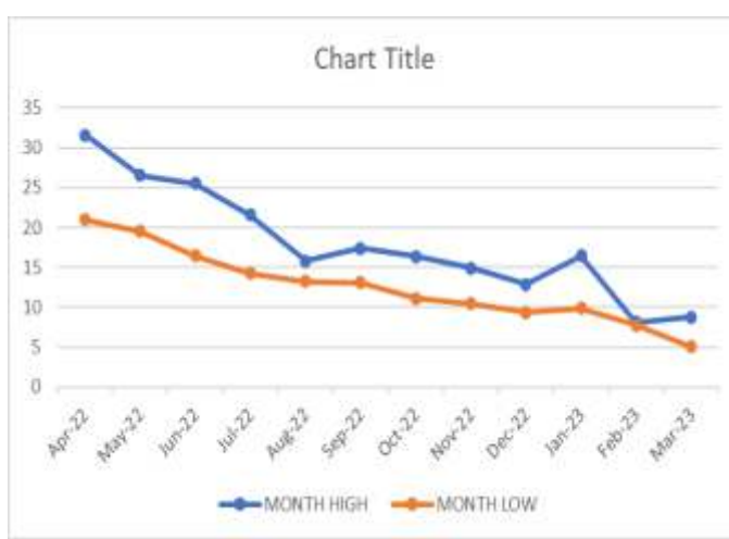
NSE Price Chart