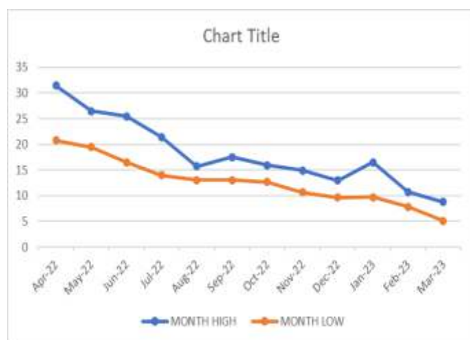
BSE Price Chart